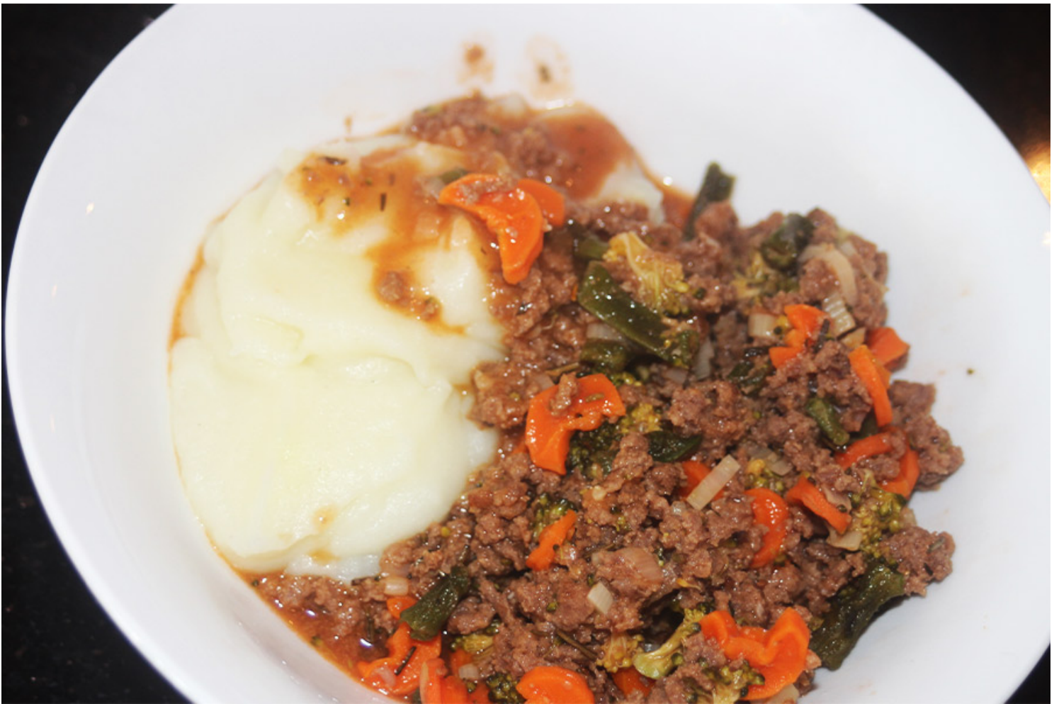
A hearty meal of rehydrated beef hotpot.