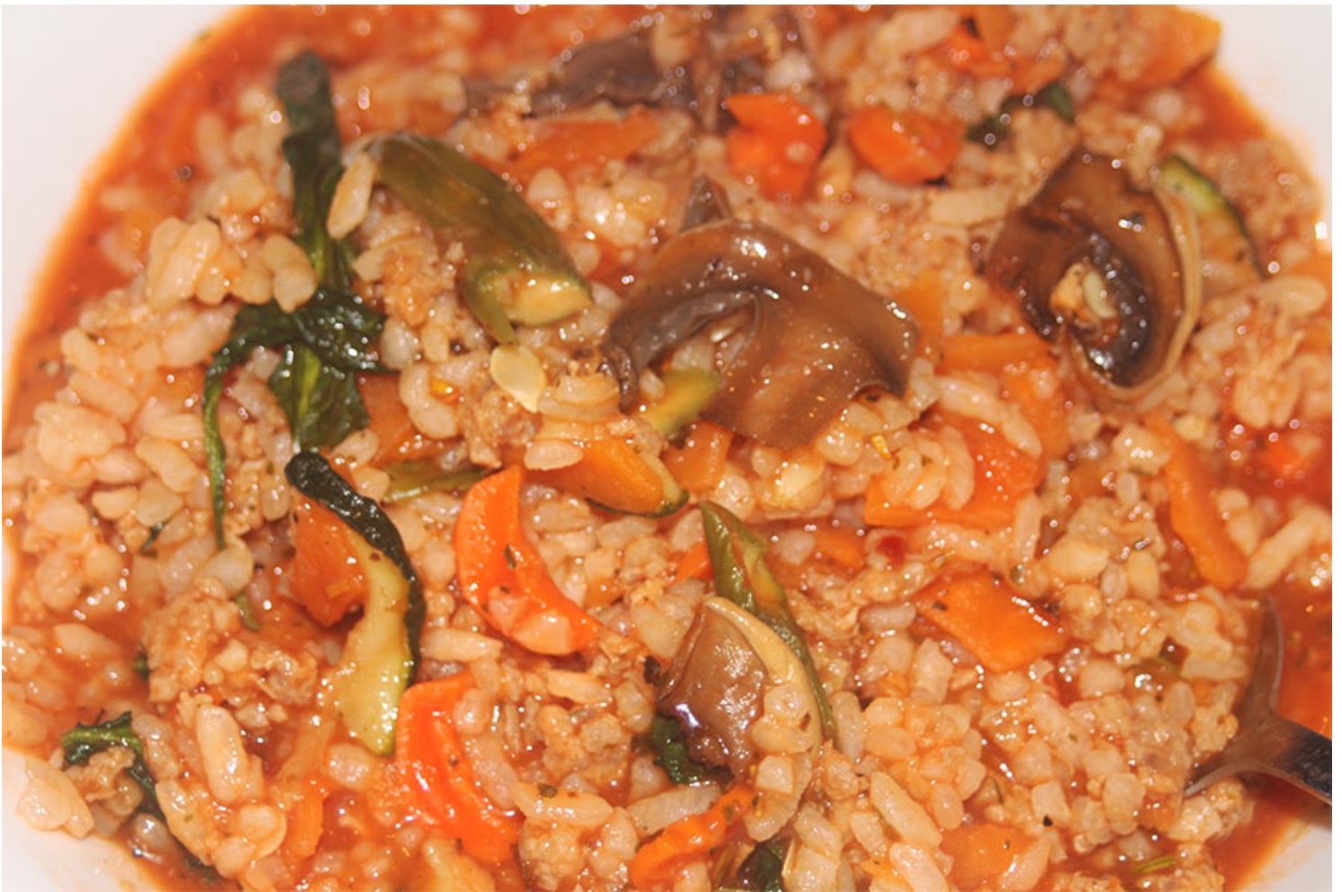
A delicious Italian risotto goes down a treat after a long day of hiking.