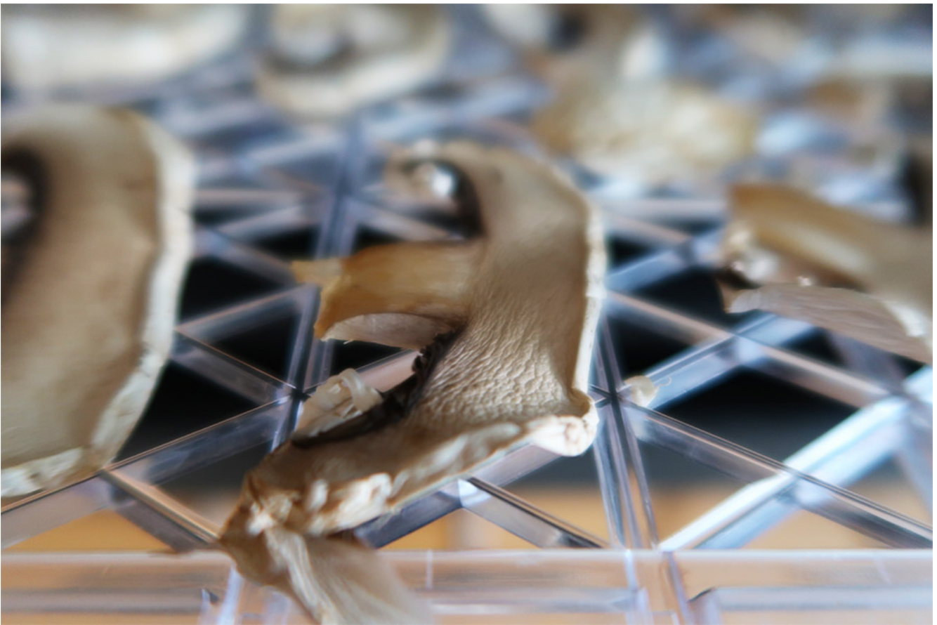
Mushrooms are one of the veggies you don't need to blanch.