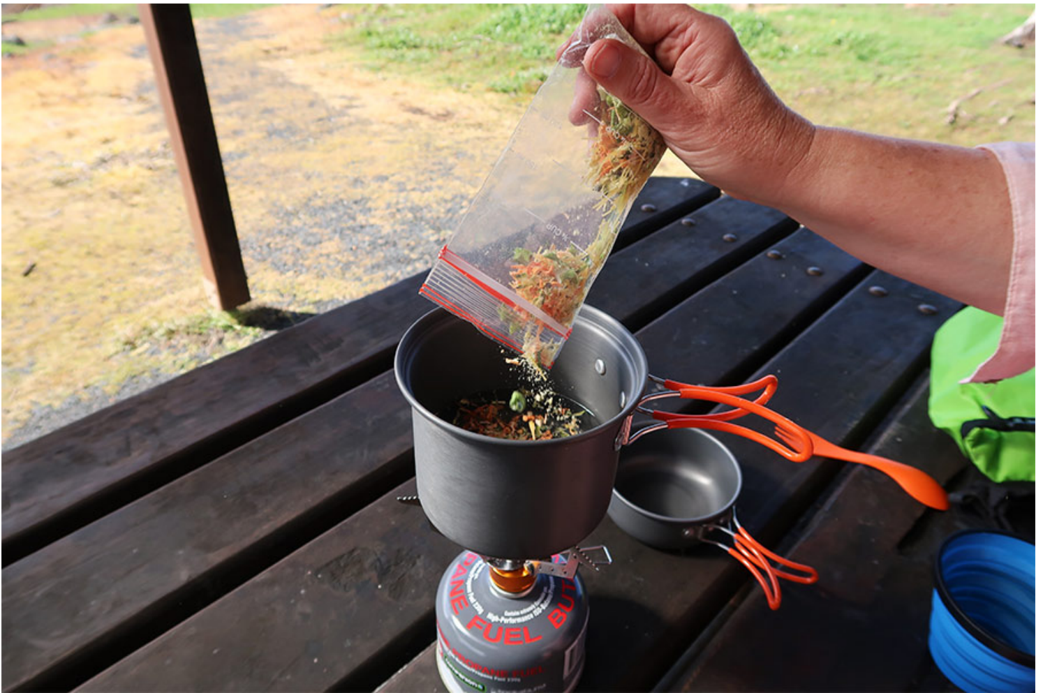
A bowl of piping hot noodle soup is a yummy treat on a cold evening at camp.