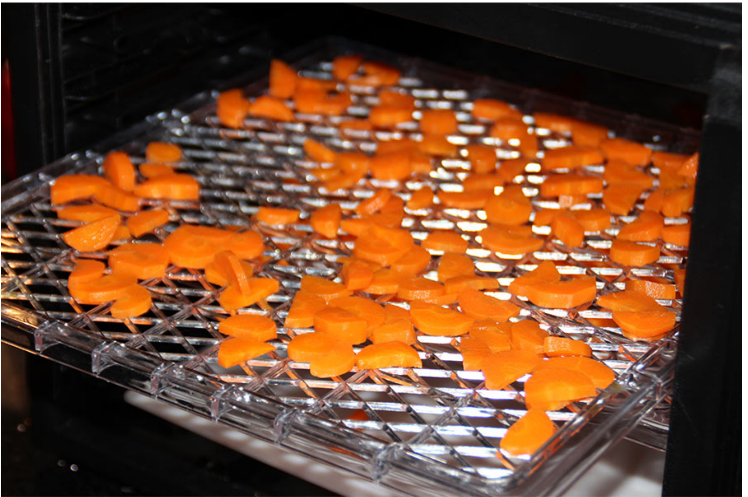
Carrot chips are a delicious snack for the trail.