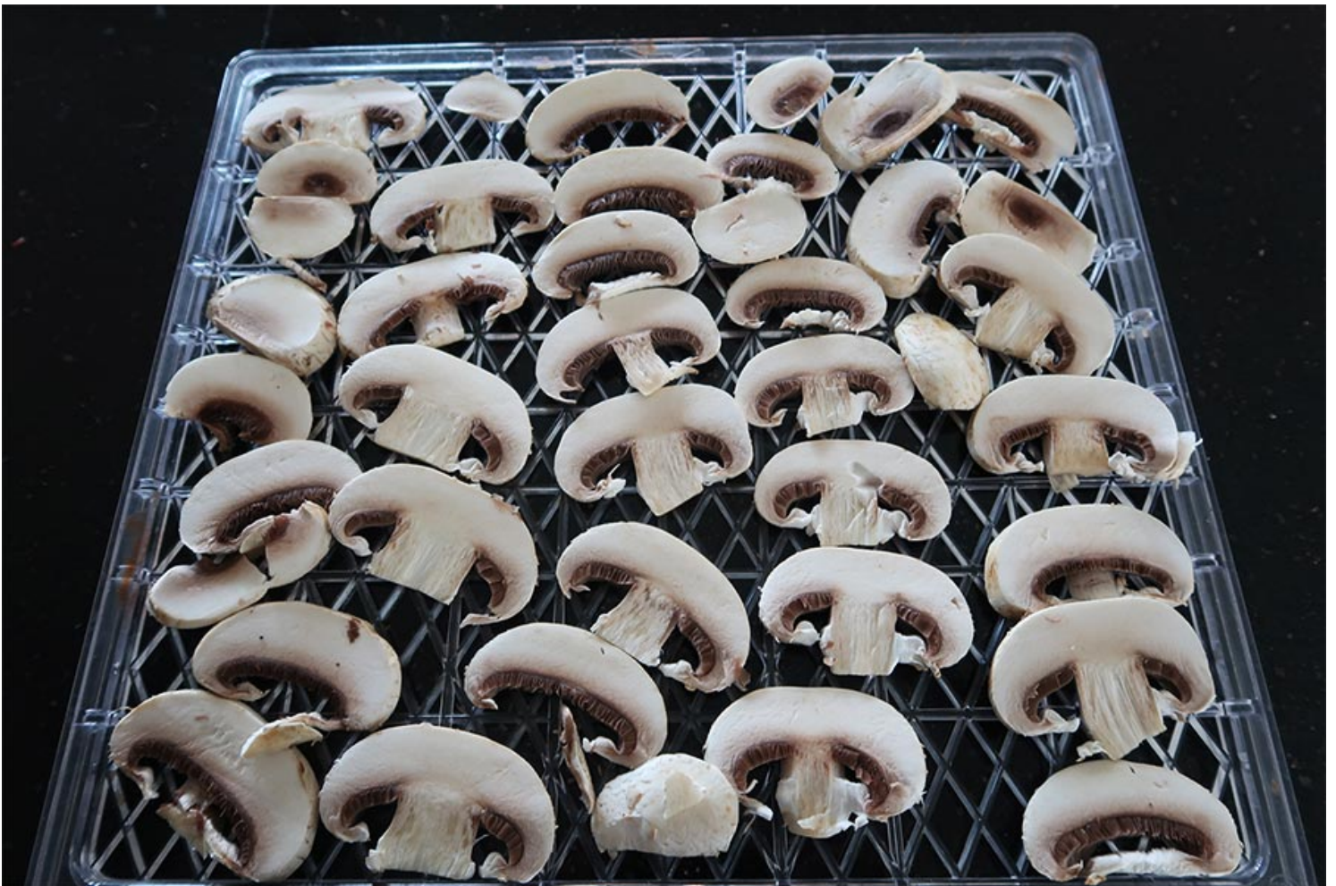
Mushrooms are one of my favourites to add to my trail meals.