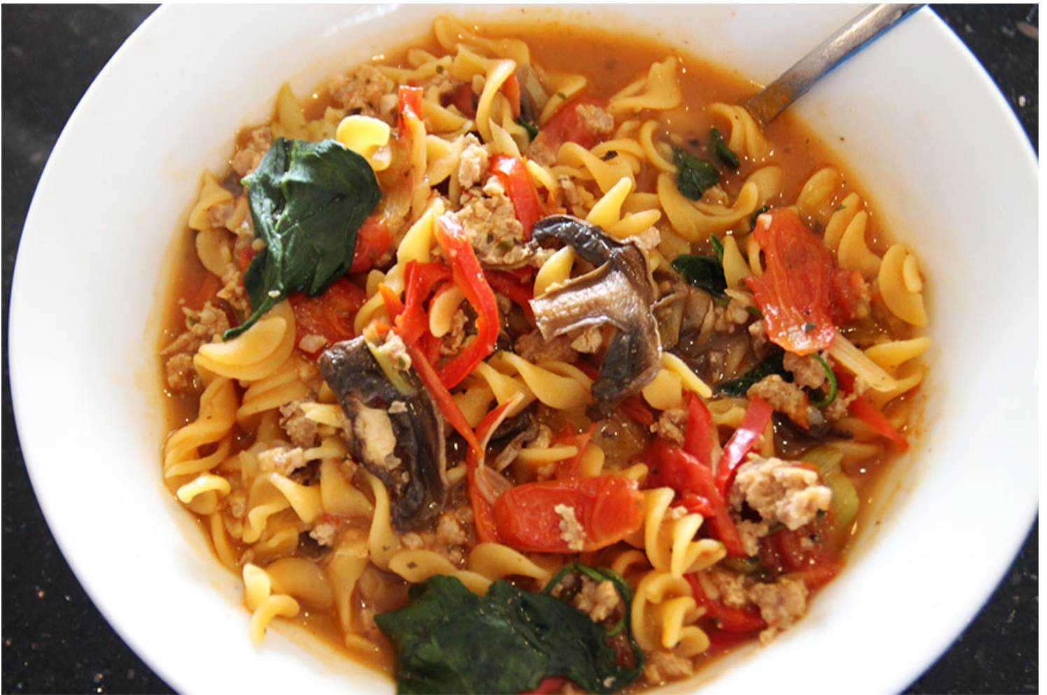
Chicken mince is best for dehydrating – then you can add it to a pasta or rice dish.