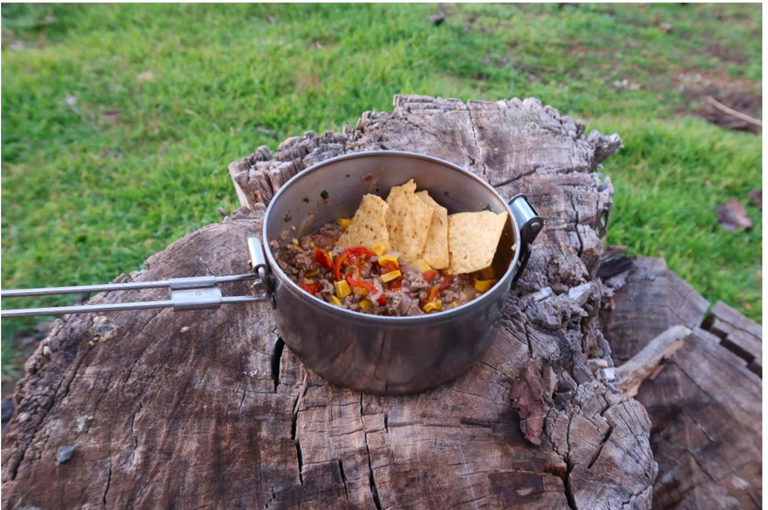
One of my fave dishes to enjoy when hiking is chilli con carne.