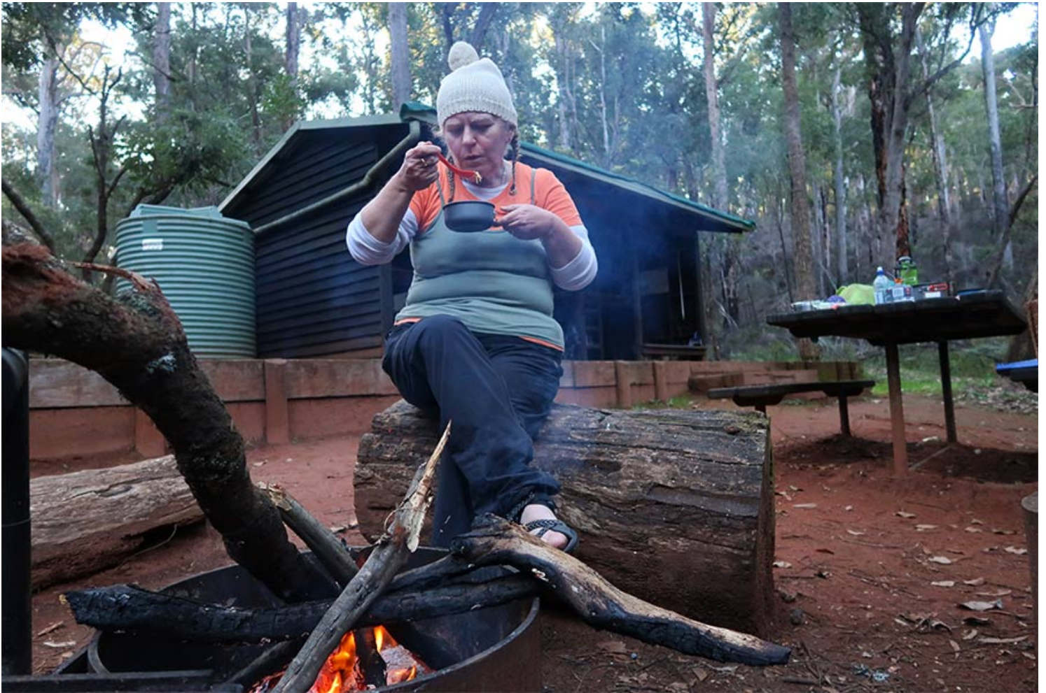
Warm up around camp with a hearty soup recipe.